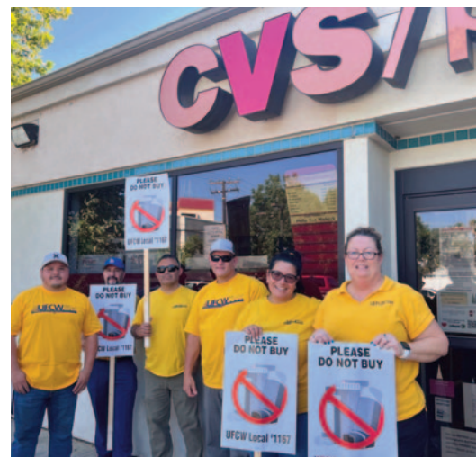
In June and July, Local 1167 staff and activists conducted informational picket lines at non-union CVS stores in UFCW Local 1167's jurisdiction.

Scholarship programs available in December! Look for the Winter Desert Edge for details!